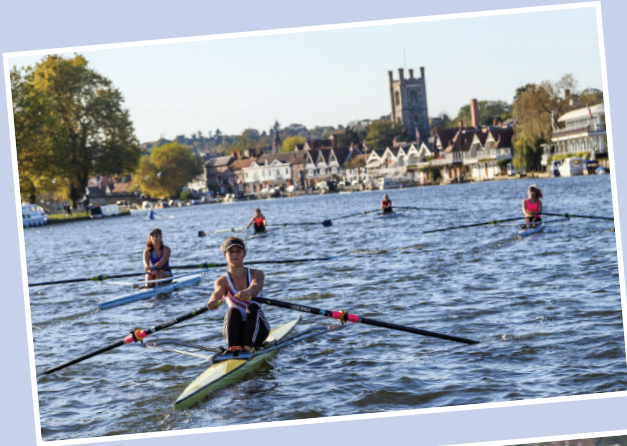
Above: The Henley Rowing Club has a large and well-medalled junior women's rowing team.