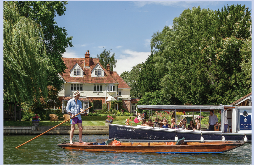
Below right: Fawley Court as seen across the Thames from Remenham Hill. It sits along the Regatta course, and is an approximate mid-way landmark for the rowers.